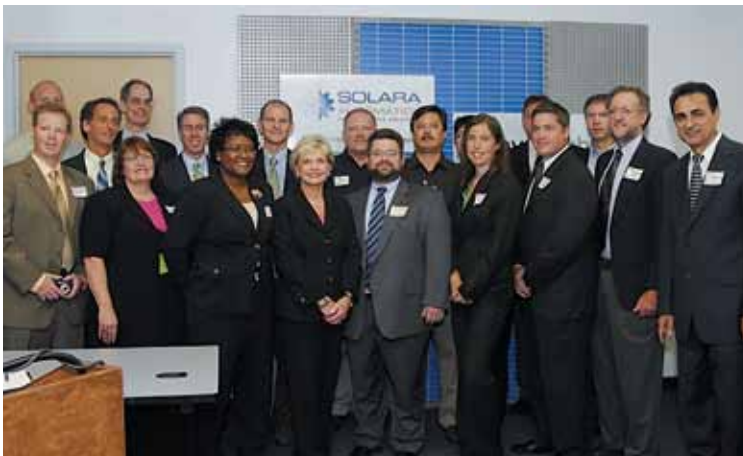
Governor Perdue with previous N.C. Green Business Fund recipients.